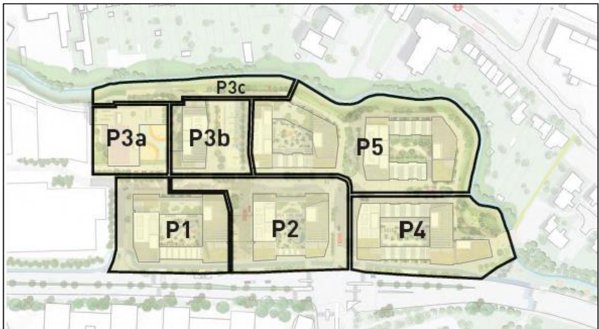
Fig 2: Indicative phasing plan